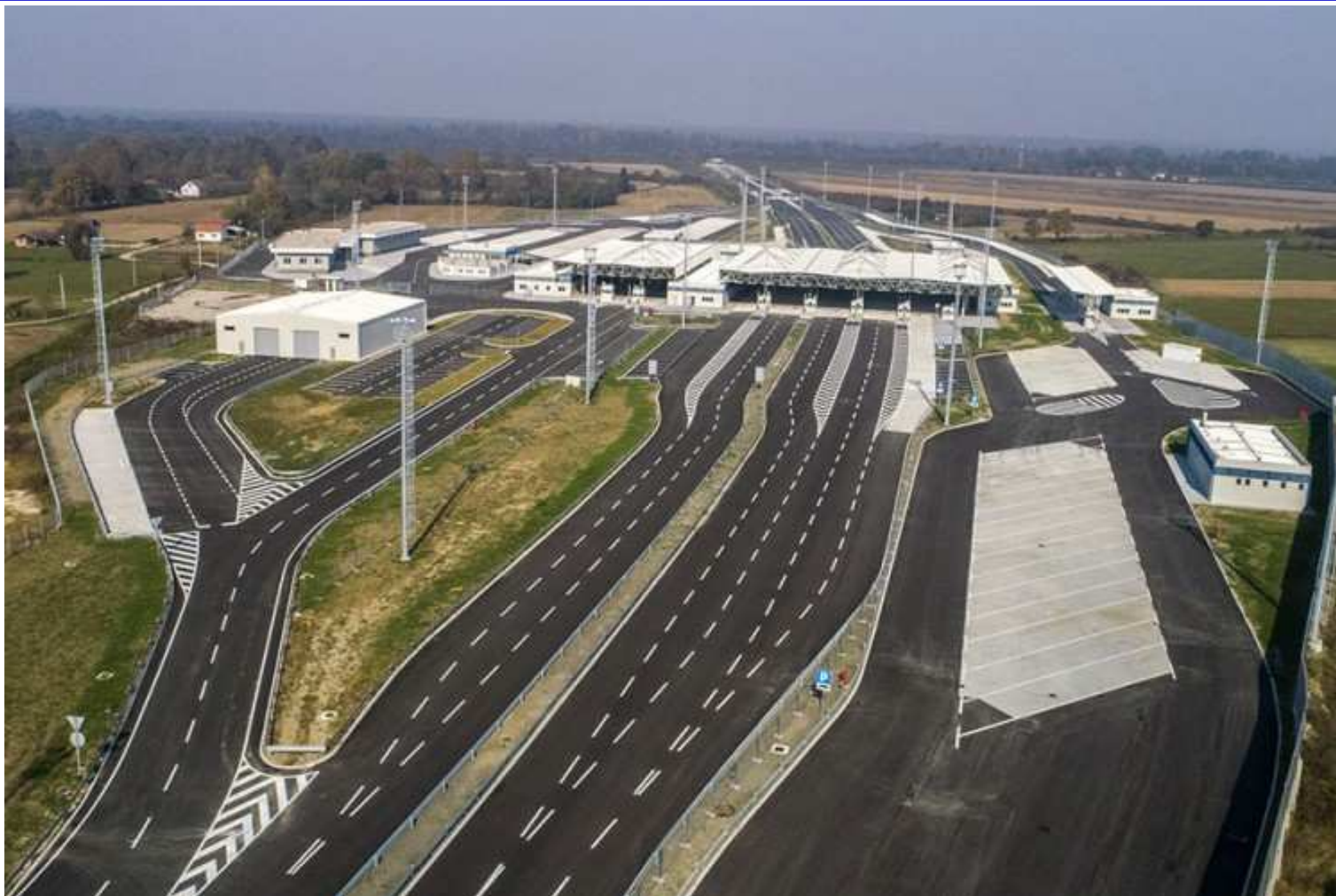
New cross border Gradiška.