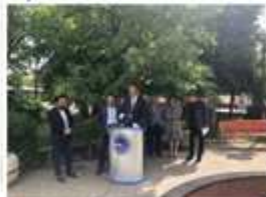
Economic cooperation is the only way to accelerate development