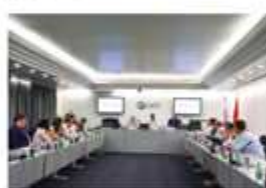
WB6 Managing Board meeting in Podgorica