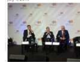
Western Balkans Six Chamber Investment Forum call for a New Deal for the Region