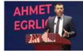
100 Greatest: Awarding the best in Bosnia and Herzegovina