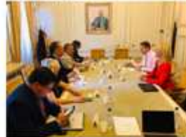
World Bank, RCC and WB6 CIF joint efforts to support regional cooperation