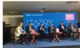
Sarajevo Export Challenges Conference said: Single, barrier-free market is what we need more than ever