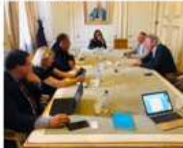
German chambers association supporting WB6 CIF