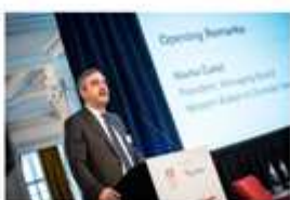
Čadež: It's worth investing in the Western Balkans