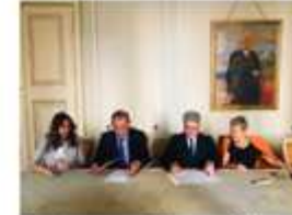
Businesses to foster skills development in the Western Balkans