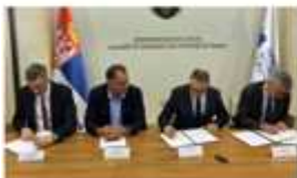
Improving trade in the CEFTA region