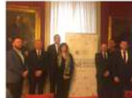
Regional platform for dialogue with EU