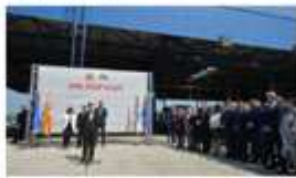
Serbia And North Macedonia open integrated border crossing for better regional cooperation