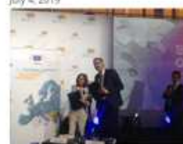
EU support to the Western Balkans Six Chamber Investment Forum